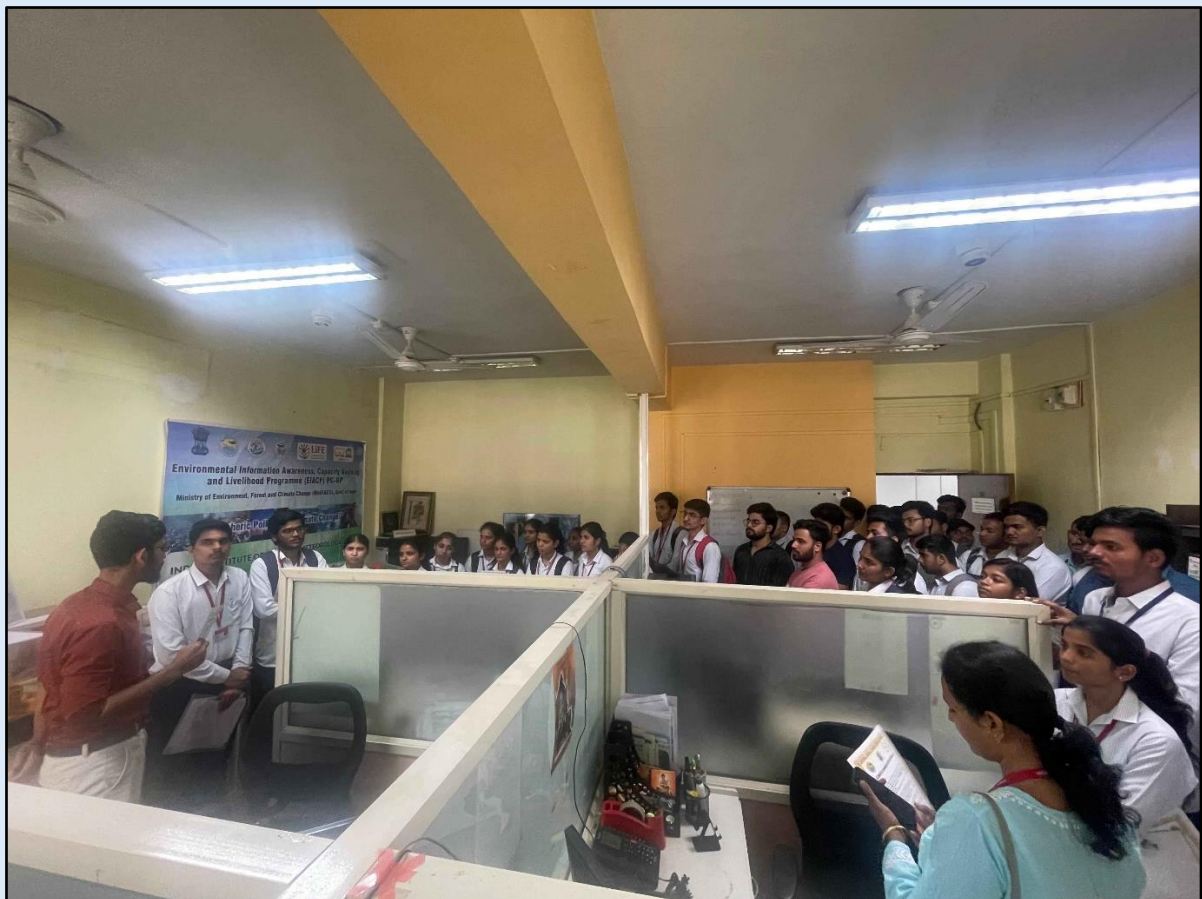
Educational Visit to IITM-EIACP by DY Patil College of Engineering