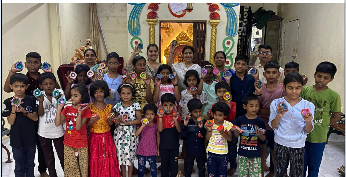
Celebrating a Sustainable Swadeshi Diwali.