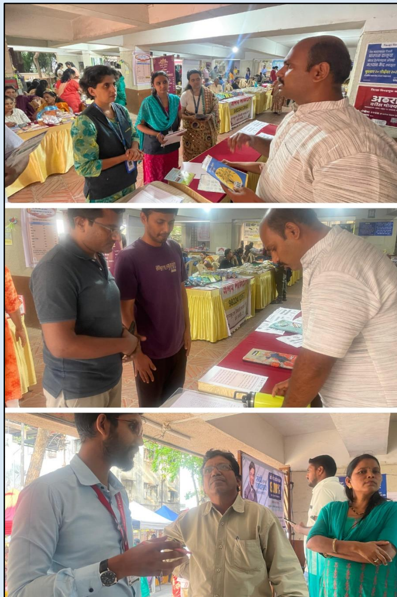
Glimpses from Celebrating a Sustainable