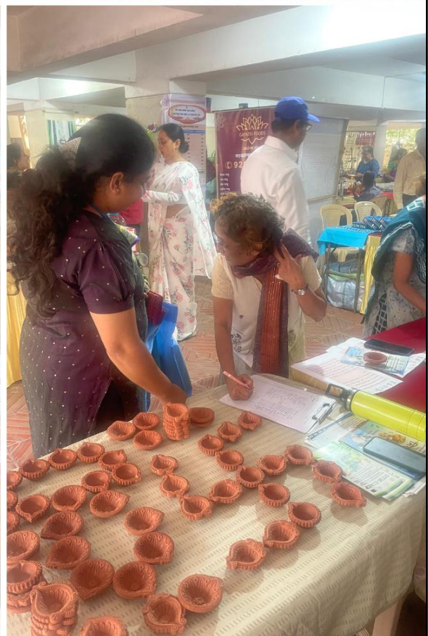
Celebrating a Sustainable Swadeshi Diwali.