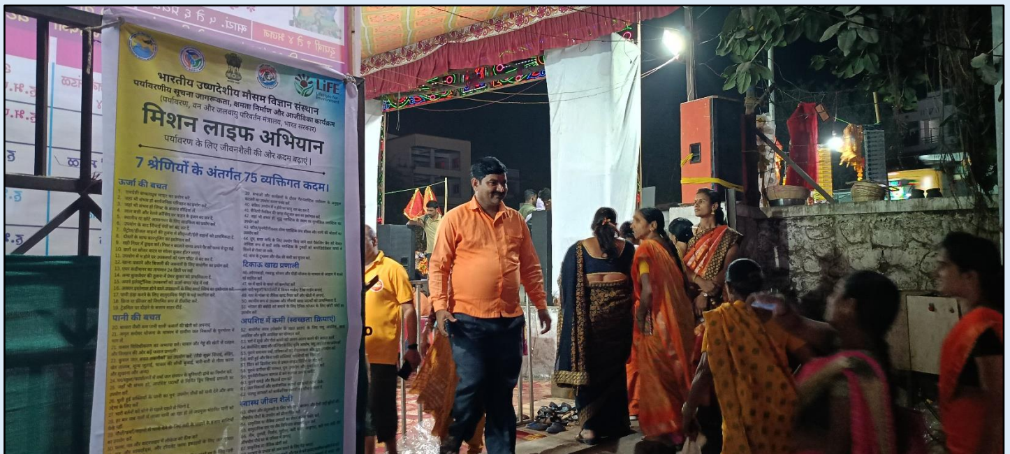
Raising Environmental Awareness Throughout Navratri Mahotsav