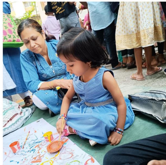
Celebrating a Sustainable Swadeshi Diwali.