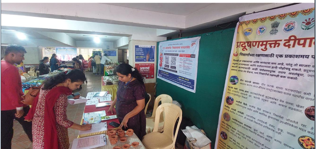
Celebrating International Day of Climate Action.