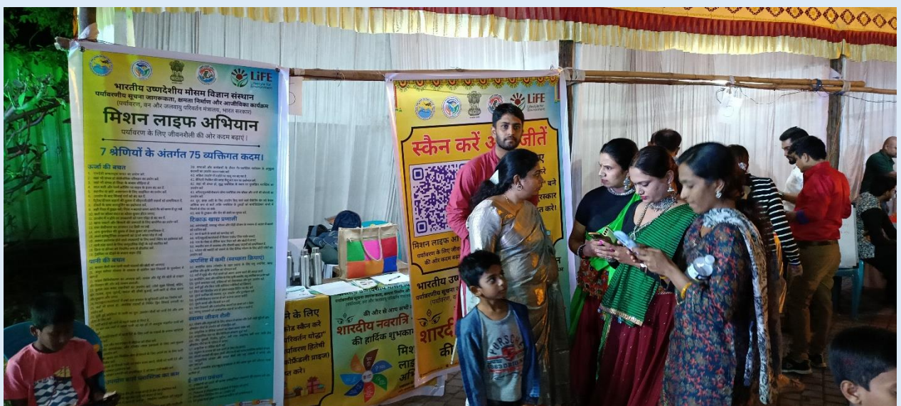
Glimpse from Mission LiFE Awareness during Navratri Utsav.